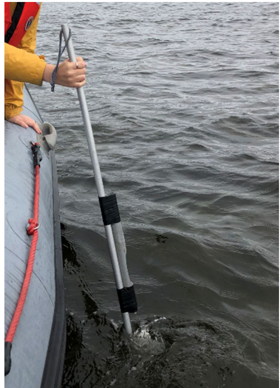
Fig. 1 Vessel-based water collection using an aluminum rod with a gauge to collect samples at a depth of 20 cm

In 2019, the Atlantic province of Nova Scotia had more than 165 commercial bivalve aquaculture leases distributed throughout the province, producing 1,830 metric tonnes of product with a farm gate value of over $5.3 million (Nova Scotia Department of Fisheries & Aquaculture, 2020). Shellfish production in Nova Scotia